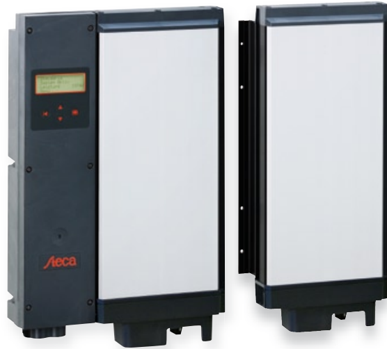
StecaGrid 2010+ Master